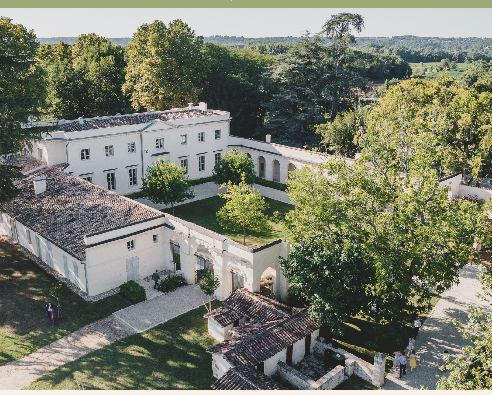
Privatize this unique estate for all your corporate events: meetings, seminars, conferences, team-building, retreats, board meetings...

An exceptional venue for your finest events in Bordeaux.